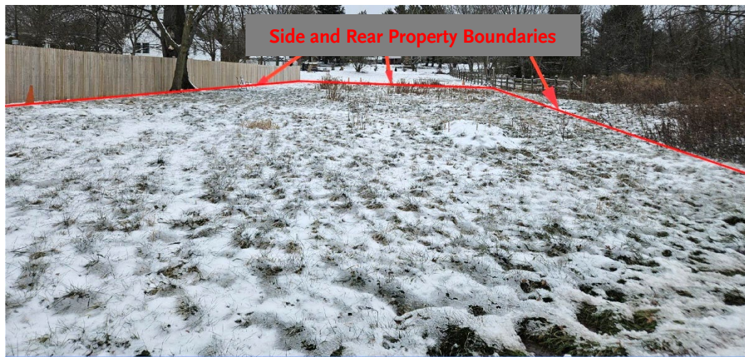
View of Vacant Lot 37 From County Route 518