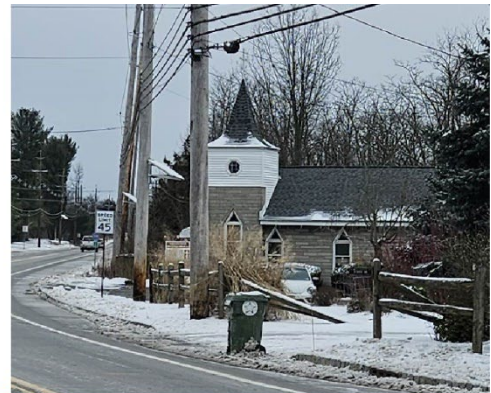
Property to the West and Nearby Church Have Undersized Setbacks