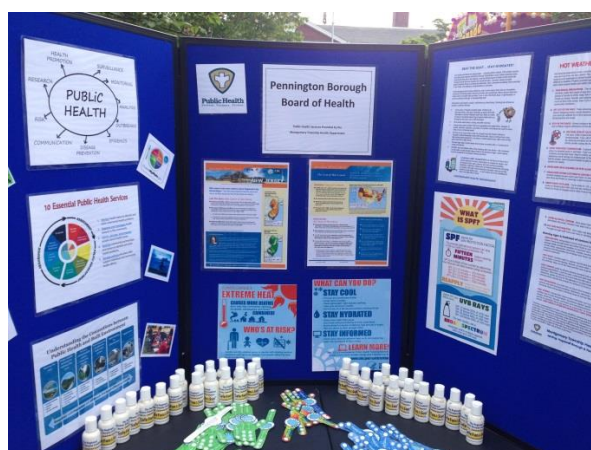
Pennington Day Festivities let visitors have fun in the sun, and learn about sun safety, too

The data on this page applies to: Hopewell Boro, West Windsor Twp, Montgomery Twp, Branchburg Twp, Rocky Hill Boro, Princeton Boro, Pennington Boro